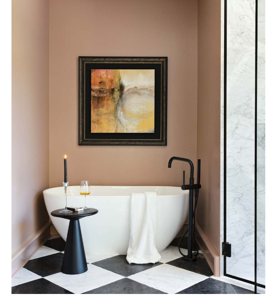
ABOVE: Before she even purchased the home, Murphy knew she wanted to install checkerboard floors in the primary bathroom. She worked with Tile Market of Sarasota to source the ideal combination of marble and limestone.

RIGHT: "The height of the shower's glass doors was meant to enhance the elevated look," says Murphy, who collaborated with Rusty Tile & Marble in Sarasota on the design.