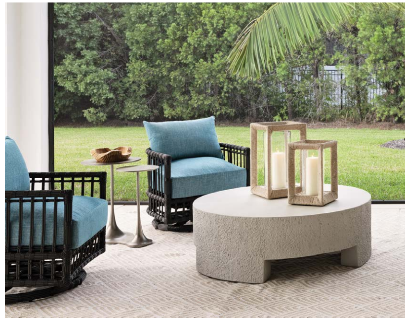
ABOVE: An outdoor seating area features Newport barrel swivel rockers from Summer Classics upholstered with Calypso turquoise indoor/outdoor fabric from Greenhouse Fabrics. A Four Hands cast concrete Kember cocktail table adds a sleek contemporary touch.

seating flows seamlessly from indoors to alfresco spaces for large holiday celebrations or intimate gatherings. Swivel chairs throughout—a TMI must-have—facilitate closeness and conversation.