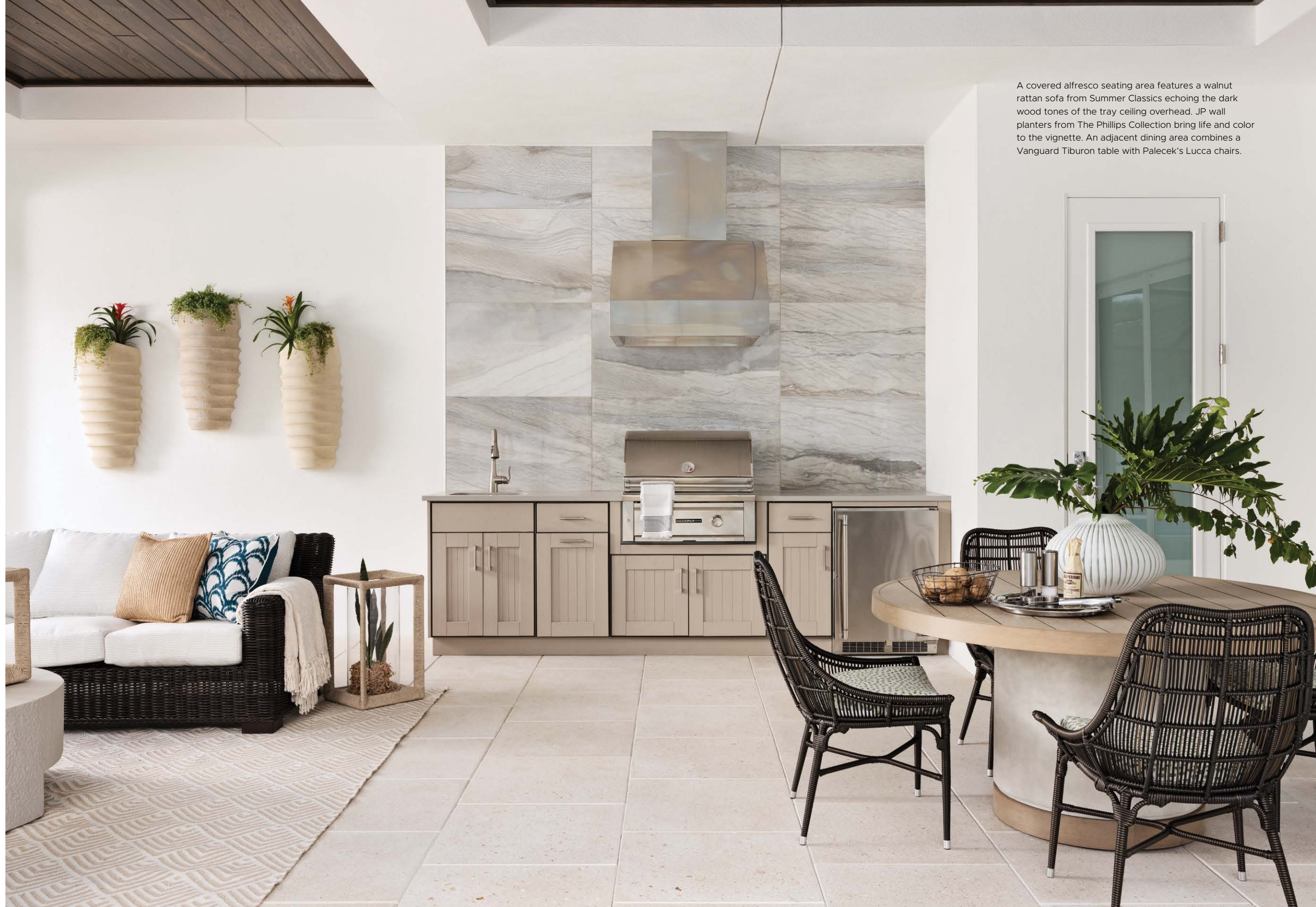
A covered alfresco seating area features a walnut rattan sofa from Summer Classics echoing the dark wood tones of the tray ceiling overhead. JP wall planters from The Phillips Collection bring life and color to the vignette. An adjacent dining area combines a Vanguard Tiburon table with Palecek’s Lucca chairs.

Bed and bedside chests – International Design Source,