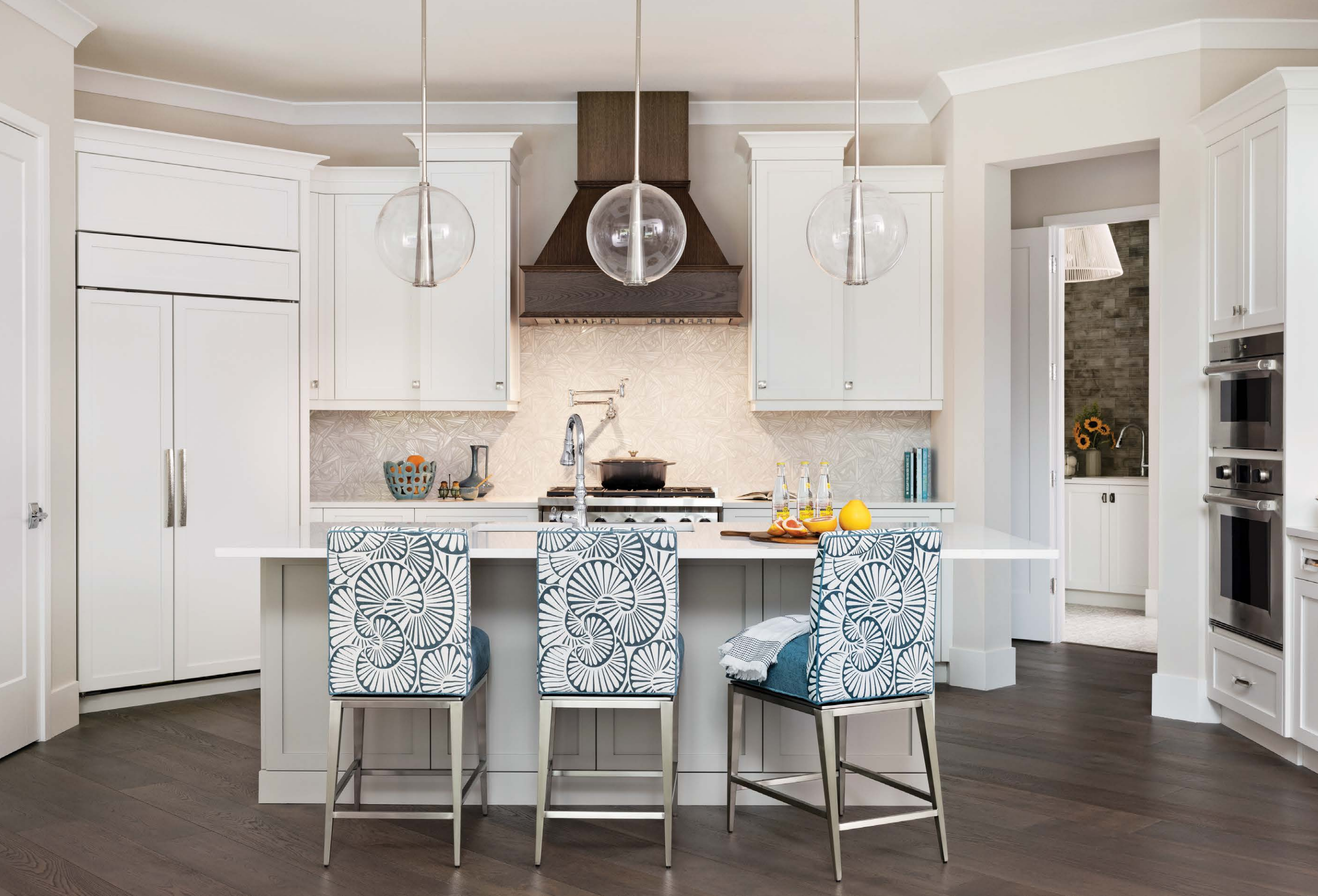
LEFT: The kitchen's Origami Alta White marble mosaic backsplash from Artistic Tile brings sheen and texture to the range wall. Fanwave upholstery from S. Harris adorns the counter stool chair backs, mirroring the tile design and Arteriors globe pendants with polished nickel rods. In the back, an Uttermost pendant and Lunada Bay Tile's champagne glass tiles dress up the mudroom.