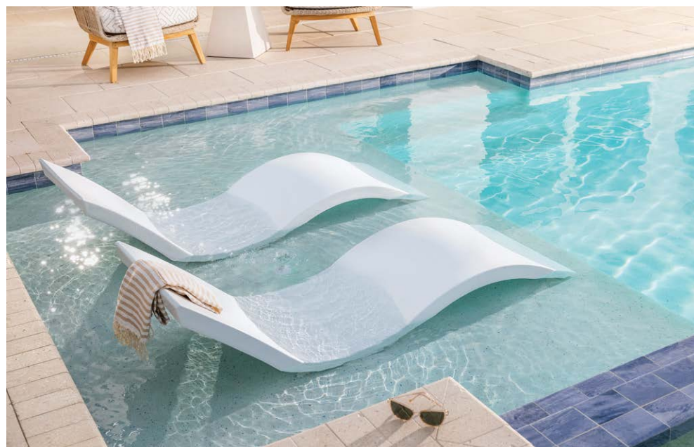
ABOVE: A pair of in-pool lounge chairs from Ledge Lounger bring graceful curves to the pool’s linear form. Cushioned chairs and a small side table invite guests to cozy up poolside.

“Tracee and Casey are skilled experts in their craft,” notes Tom. “Their creativity is unmatched, and their greatest attribute is listening deeply to reflect the client’s desire. Simply put, they made a long process easy and were a joy to work with.”